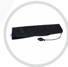
Full Leg Wrap-L Part Code: KRP/MYY-G6-L