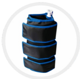
Leg Wrap Part Code: KRP/MYY-C6