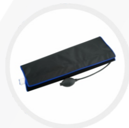
Full Leg Wrap-M Part Code: KRP/MYY-G6-M