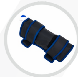
Hand/Wrist Part Code: KRP/MYY-I6