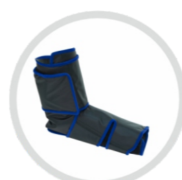
Ankle pro Wrap Part Code: KRP/MYY-A6-M