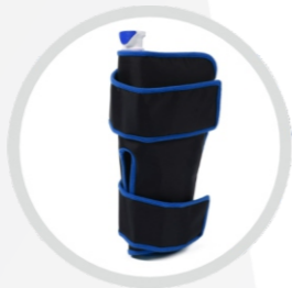
Knee Wrap Part Code: KRP/MYY-H6