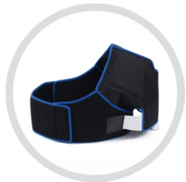
Shoulder Wrap Part Code: KRP/MYY-B6