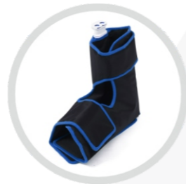
Ankle Wrap Part Code: KRP/MYY-A6