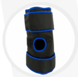
Full Knee Wrap Part Code: D-KRP/MYY-F6