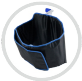
Back Wrap Part Code: KRP/MYY-E6