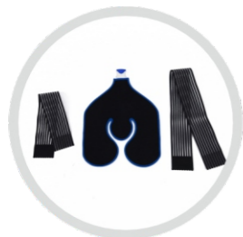
Universal Wrap Part Code: KRP/MYY-T6